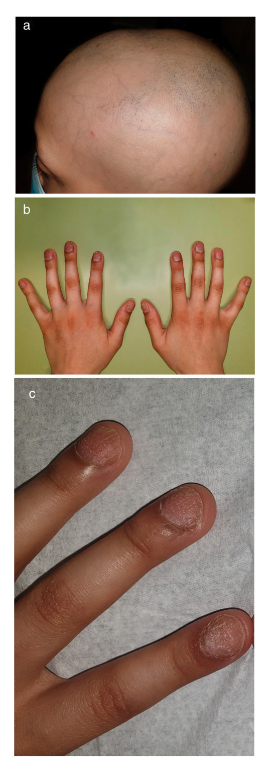
Figure 1 (a) Multilocular alopecia areata; (b) and (c) Fingernail pitting and trachyonychia.

The present case describes a new IRF6 mutation, although the experimental design lacks a direct functional test. It also raises awareness for a potential undescribed association between a common hair disorder and a rare genetic syndrome. Thus, it specifically sparks further interest in understanding the complex pathophysiological