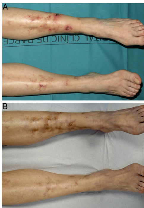
Figure 2 Livedoid vasculopathy (patient #3). A, Ulcers and erosions, erythema, and atrophic scars on the ankles and feet. B, Complete response after 3 months of treatment with rivaroxaban.

for more than 1 year, and 2 of them for 2 years or longer. They all responded fully. Two patients relapsed following a dose reduction, but this was resolved by increasing the dose to 10 mg/12 h. LV flare-ups inadequately controlled by