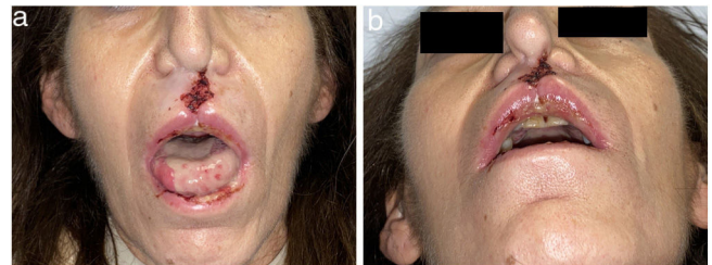
Figure 2 A and B, Cocaine-induced midline destructive lesions with collapse of both nostrils, saddle nose deformities, and chronic oral mucositis.

Blood tests may show positivity for anti-MPO antibodies, HNE, lactoferrin, and cathepsin G with a perinuclear