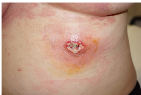
Figure 4 Pyoderma gangrenosum on the trunk.

Histologic findings include tissue necrosis, acute or chronic perivascular inflammatory infiltrates, microabscesses, leukocytoclastic vasculitis, and thrombosis of venules and arterioles, which may be partially or totally organized. Granulomatous inflammation has not been described. 9