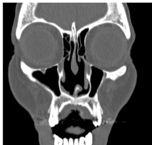
Figure 3 Computed tomography scan of the patient in Fig. 2. Note the perforation of the nasal septum.

pattern, and, less frequently, anti-PR3 antibodies with a cytoplasmic pattern.