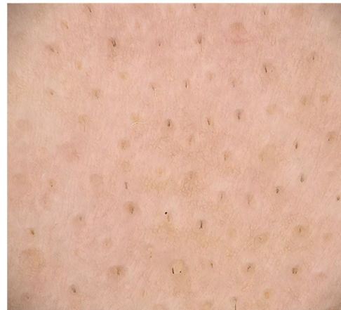
Figure 1 Black dots.

The frequency of yellow dots varies with age, Fitzpatrick skin phototype, imaging technique applied (polarized or nonpolarized light dermoscopy and use of immersion oil),