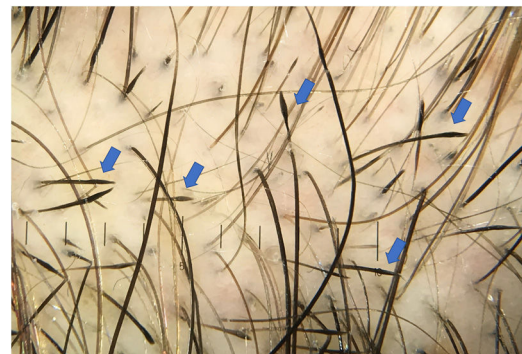
Figure 7 Tulip hairs.

Large white dots, which are present in chronic AA, are irregular and correspond to areas of follicular fibrosis. Pinpoint white dots are regular, smaller, and correspond to the