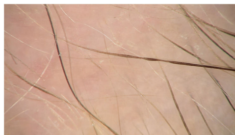
Figure 6 Pohl-Pinkus constrictions.