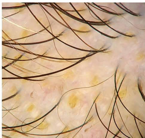
Figure 2 Yellow dots.

slightly larger than the thickness of the terminal hair shafts in the anatomical region where they are found. 8