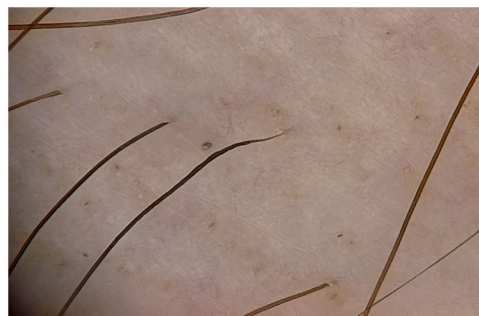
Figure 4 Tapered hairs.

severity of the disease and are a negative prognostic marker. 21 Their presence could be a positive predictive marker of the response to corticosteroids. 24