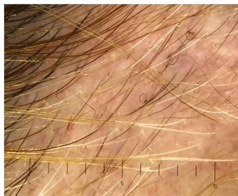
Figure 5 Pigtail (circle) hairs.

Upright regrowing hairs are seen more often in children, probably because more extensive growth of the hair is more common at this age. They are not pathognomonic of AA and are observed in acute telogen effluvium, trichotillomania, tinea capitis, and temporal triangular alopecia. 4,24