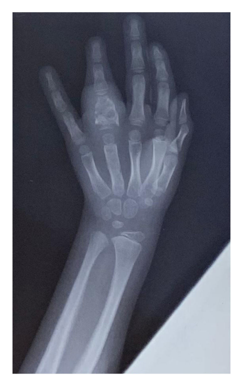
Figure 2 Radiograph of the left hand showing osteolytic lesions in the phalanx of the fourth finger.

left hand (Fig. 2) and the left elbow. Abdominal ultrasound and chest radiography showed no abnormalities. A wholebody bone scan showed increased uptake at the fourth finger of the left hand, the proximal epiphysis of the left humerus and ulna, and the right ankle.