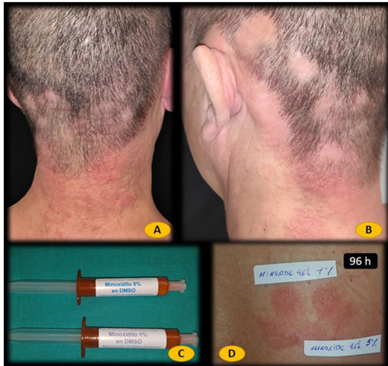
Figure 1 A and B, Eczematous rash on the neck. C, Minoxidil 1% and 5% in dimethyl sulfoxide (DMSO) prepared by the hospital pharmacy. D, Negative patch test to minoxidil 1% and 5% in DMSO on day 2. E, Positive patch test to minoxidil 1% and 5% in DMSO on day 4.