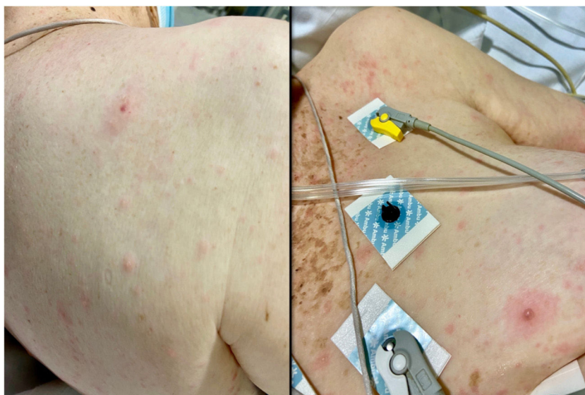
Figure 1 Polymorphous eruption consisting of macules, papules, and some vesicles on the patient's arrival at the emergency department.