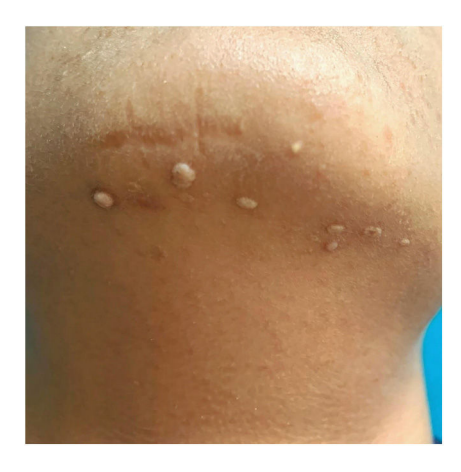
Figure 1 Indurated whitish papules on the chin.