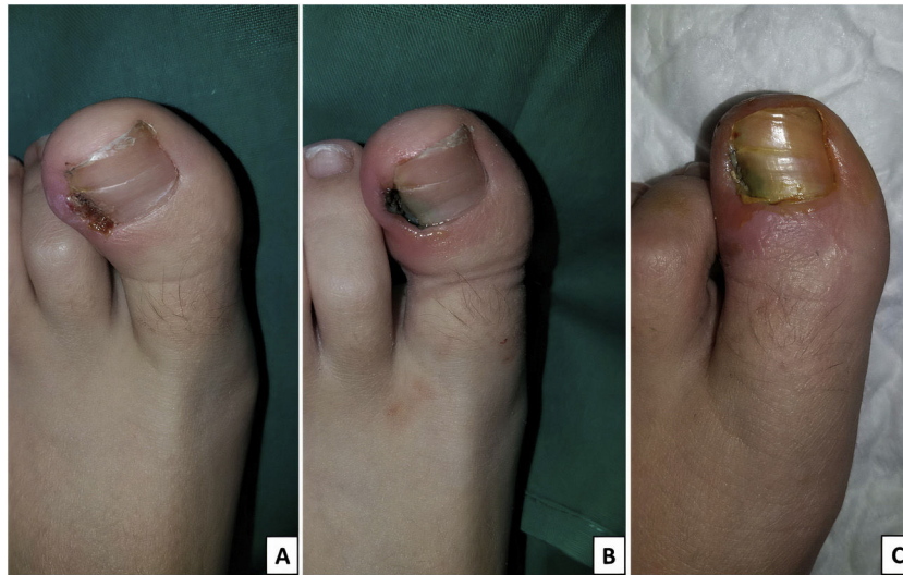
Figure 2 Ingrown toenail before the surgical procedure (A); clinical features immediately after the intervention (B); and 7 days after the procedure (C).