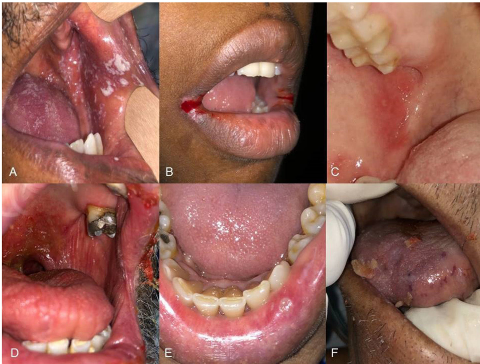
Figure 1 Oral lesions in COVID-19 patients. A, Pseudomembranous candidiasis. B, Angular cheilitis. C, Enanthem on the cheek. D, Soft palate ulcers and xerostomia. E, Aphthoid ulcer on the lip. F, Hemorrhagic ulcers on the tongue.