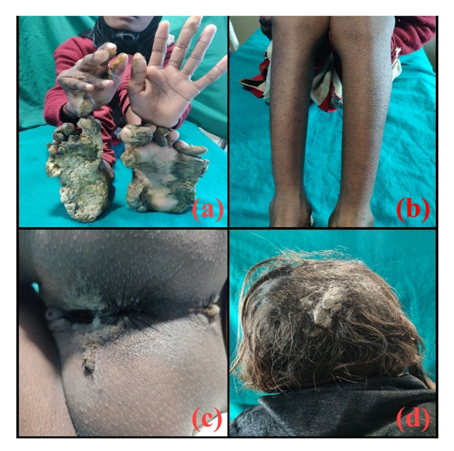
Figure 1 (a) Hyperkeratotic growths over the soles and palms and flexion deformity of the right hand. (b) Generalized follicular keratosis of the legs. (c) Hyperkeratosis in the gluteal cleft. (d) Pityriasis amiantacea of scalp.

A 10-year-old female presented with well-defined symmetrical hyperkeratotic plaques over palm and sole which started developing from the age of 2 months. The lesions were painful and she was unable to walk properly without shoes. She was born of normal vaginal delivery with no history of consanguineous parents. There was no history of similar complaints in the family including two siblings. She achieved normal developmental milestones.