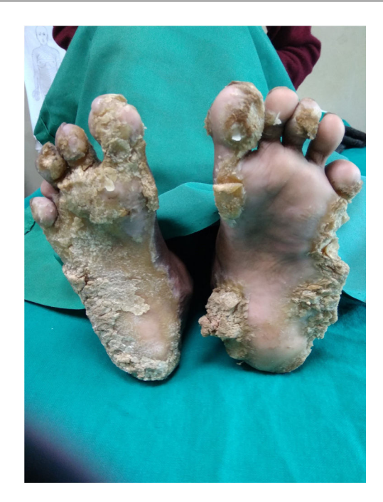
Figure 3 Partial improvement after 8 weeks of acitretin.

The disease usually begins when the child starts to walk and grasp objects. Palmoplantar keratoderma is of transgradiens type and is severely disabling. Keratotic papules develop over the periorificial areas and may extend to the flexures. Fissuring of the toes occurs leading to autoamputation of the digits and skin thickening may lead to flexion deformities.<sup>4</sup> Our patient had mutilating