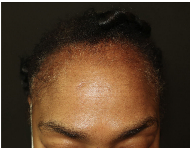
Figure 1 Frontal capillary hypodensity.