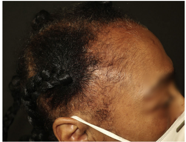
Figure 2 Temporal capillary hypodensity associated with a high-traction hairstyle.

Traction alopecia (TA) is caused by the direct mechanical damage done by hairstyles involving considerable traction 1 . It is more frequent in women and has been reported in up to a third of African-American women, although it can affect all phenotypes 2 . It is associated with the use of pony tails, plaits, extensions, chemical hair-shaft relaxers, turbans, and headbands 3,4 . The condition is a reversible alopecia in