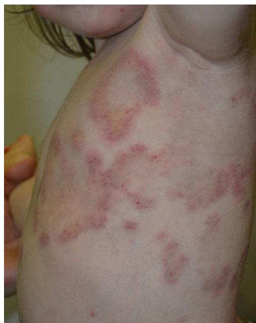
Figure 1 Multiple annular and polycyclic erythematous plaques with purpuric macules and indurated borders devoid of crusts, vesicles or desquamation distributed along her left chest and axillae.

Ten months after the beginning of plaques, a complete blood count was performed, which showed leukocytosis: 28,600 WBC/mm 3 with 22% monocytes and blast cells. A myelogram showed hypercellularity and 12% blast cells with monocyte-like appearance. The immunophenotype showed 17% immature monocytoid cells. Her fetal hemoglobin concentration was 24%. The translocation study (t9:22, t8:1 and t15:17) was negative. Therefore, juvenile myelomonocytic leukemia (JMML) was diagnosed. She began oral chemotherapy with hydroxyurea, observing an important improvement in the cutaneous lesions.