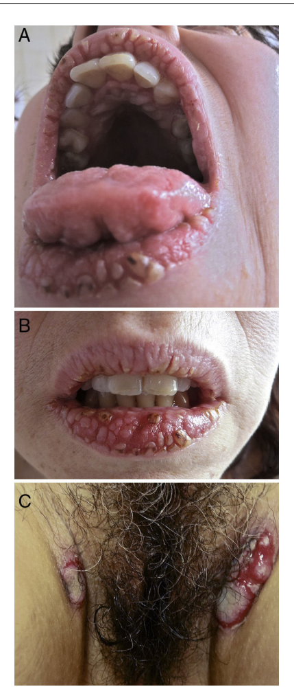
Figure 1 (A, B) Painful white verrucous papules, fissures, erosions, and crusts on the vermillion border of the lips and the hard palate (cobblestone pattern); sulci and gyri on the dorsum of the tongue (cerebriform tongue). \[mathbb{O} Oozing, raised erythematous plaques with a verrucous surface on the inguinal folds.

Pemphigus vegetans is a rare variant of pemphigus vulgaris, and is thought to represent a reactive response of the skin to the autoimmune insult of pemphigus vulgaris.<sup>1</sup> It is characterized by flaccid blisters that erupt into erosions and eventually form papillomatous vegetations, especially in intertriginous areas and on the scalp or face.<sup>1,2</sup> Involvement of the vermilion border of the lips is a clinical hallmark of oral involvement.<sup>3</sup> The tongue may show cerebriform-like changes.<sup>1</sup> The exuberant cobblestone pattern of the lips and oral mucosa associated with marked weight loss in the current case highlights the importance of oral manifestations of pemphigus vegetans.