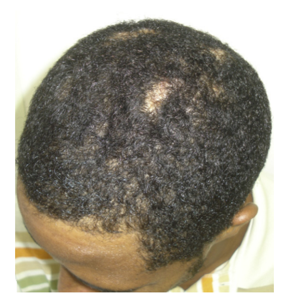
Figure 1 Alopecic patches with discrete nodules of DCS, resembling AA.

Dermoscopy of the alopecic patches showed yellow dots, red dots, empty follicular openings, black dots and cadaverized hairs (Fig. 2a). Exclamation mark hairs were absent.