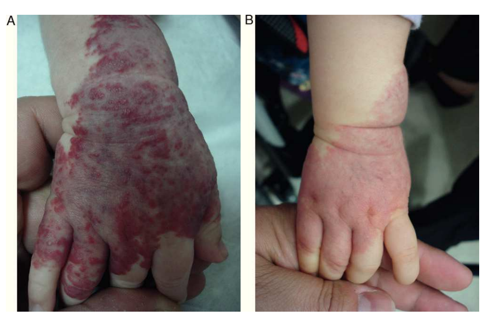
Figure 1 Patient number 3. (A) Start at two-months and (B) one-year follow-up.

Patients were evaluated monthly with the protocol stated earlier; some of them had finished their treatment while others were still on treatment when this paper was written. We considered the last visit for evaluating effectiveness and as the final outcome. 50.6% (39/77) of IH had CR evaluated by the three investigators. 49.3% (38/77) had PR, and 0/77 IH