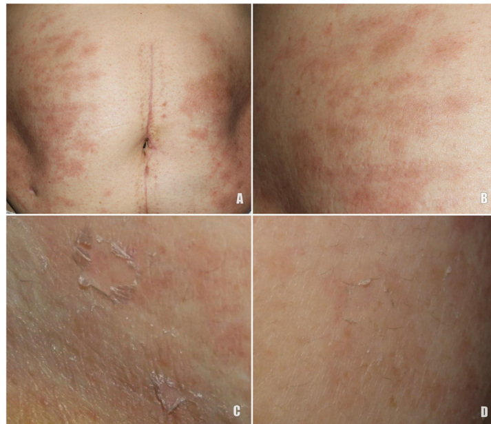
Figure 1 A, Multiple oval pink macules with collarette scaling, symmetrically distributed on both flanks. B, Detail of lesions on right flanks. C and D, Detail of collarette scaling observed in several lesions.

Imatinib was discontinued and treatment started with topical betamethasone and oral loratadine 20 mg every 12 hours. The lesions resolved completely within 2 weeks. Considering the favorable outcome, the patient was restarted on imatinib at a dosage of 100 mg every 12 hours,