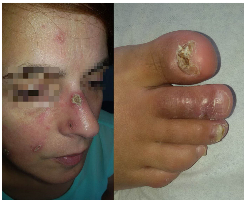
Figure 1 Erythematous lupus pernio lesions on the face with crusts on the surface. Dactylitis in 3 toes of the right foot associated with nail disease.

Blood tests showed increased levels of angiotensin-converting enzyme and acute phase reactants, and serology for syphilis was negative.