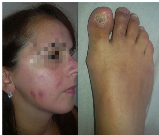
Figure 3 Favorable clinical course after 3 months of systemic treatment with prednisone associated with hydroxychloroquine.

Lupus pernio is one of the most characteristic lesions of sarcoidosis, which is more frequent in Caucasian women with long-term disease, as in our case. 1 It is characterized by pink or violaceous papular lesions on the nose, cheeks, ears, lips, or scalp. It tends to be associated with chronic sarcoidosis and involvement of the upper respiratory apparatus. If the lupus pernio lesions are located on the fingers or toes, cystic bone lesions on the phalanges of the affected members are often observed. 6