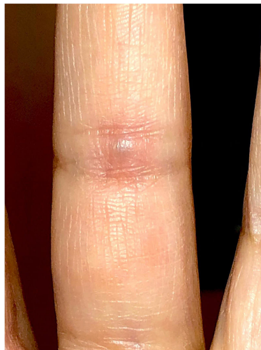
Figure 1 Bluish-violet nodule on the palmar side of the digit.

A bluish-violet nodule of 4 mm was observed on the palmar side of the third digit, at the level of the proximal interphalangeal (PIP) joint (Fig. 1). The nodule was highly sensitive on compression and it was fixed to the subcutaneous structures. No color change on the tip of the digit was present and pulsation at both the left radial and ulnar arteries was normal. Physical examination was not otherwise remarkable.