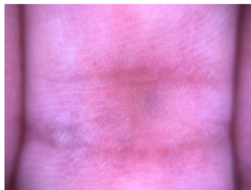
Figure 2 Dermoscopic examination: blue structureless pattern.

Laboratory studies including complete blood count, prothrombin time, activated partial thromboplastin time, proteins C and S, factor V Leiden, antithrombin III, anticar-