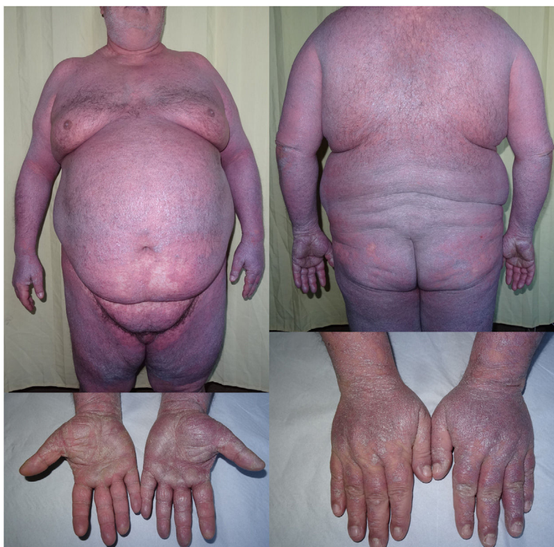
Figure 1 Top left and right, Extensive erythematous-violaceous Dermatitis with lichenoid sheen. Bottom right, Erythematous-violaceous papules with a lichenoid sheen on the backs of the hands and fingers. Bottom left, Shiny palmar keratoderma.