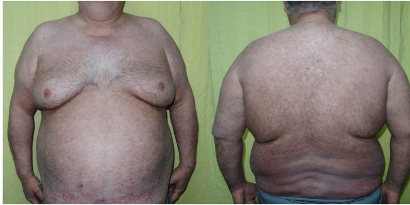
Figure 3 Resolution of the erythroderma after administration of 400 mg/24 h of cyclosporin A for 30 days. Residual hyperpigmentation.

In the case of our patient, no drugs prior to the rash were identified. Moreover, the response to cyclosporin was excellent, with no relapse when the drug was suspended. This drug has been used sporadically and successfully in lichen planus 6 and its use may be considered to achieve rapid control of symptoms when lesions are very extensive.