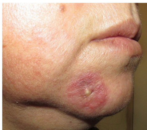
Figure 1 Infiltrated erythematous plaque with edematous edges, and open comedones and milium cysts.

Comedonic or comedonal lupus is a rare entity and a rare variant of chronic cutaneous lupus erythematosus. It is similar to other clinical entities such as acne, which can sometimes make diagnosis difficult. 1,2 Very few cases have been reported in the medical literature and this disease is therefore thought to be underdiagnosed. 1,3 Clinically, it is