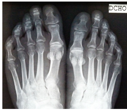
Fig. 3 Simple anteroposterior x-ray with no abnormal bone findings.

In conclusion, we present a case of bilateral double nail of the fifth toe, which developed following acute trauma.