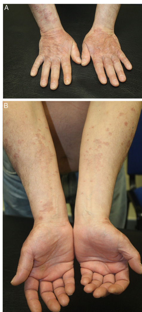
Figure 1 Clinical presentation of the patient. A, Brownish, arciform, erythematous plaques with a tendency to coalesce on the backs of the hands and the dorsal aspect of the forearms. The lesions were mildly infiltrated and lacked an appreciable epidermal component. B, The lesions extended to the volar aspect of the forearms, where they were milder and coalesced less.

In a photoprovocation test, UVB irradiation of the back and shoulder had no effect, while UVA irradiation (24.42 J/cm 2 ; Fig. 2B) resulted in the appearance of some micropapules and erythema after 48 hours. The lesions reappeared on the following days of the photoprovocation test, up until day 6 (cumulative dose, 97.71 J/cm 2 ). Based on this