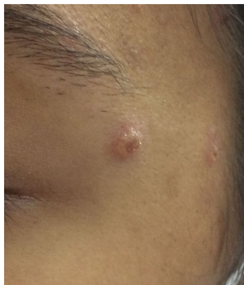
Figure 1 Molluscum-like lesion on the face.

Histology revealed a dermal inflammatory infiltrate with neutrophils, vacuolated spaces, and yeast-like structures