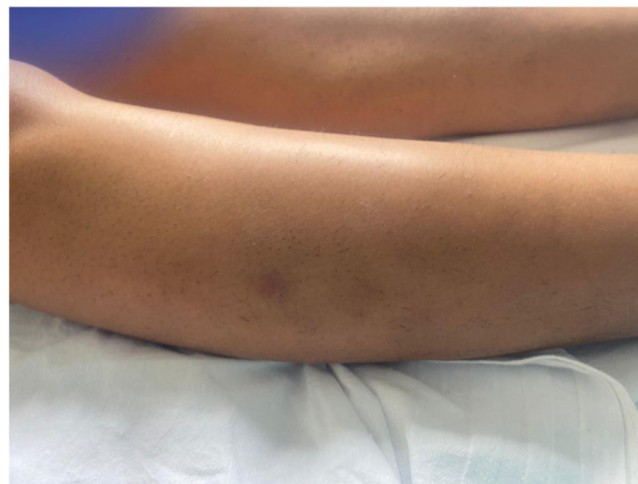
Figure 1 Nodular lesion (2 cm in diameter) with a brownish surface located on the outer aspect of the right leg.

Eosinophilic panniculitis is a very rare form of panniculitis. It affects women more frequently than men (3:1 ratio), and its incidence peaks in the third and sixth decades of life. 2 It is a reactive process secondary to a range of stimuli,