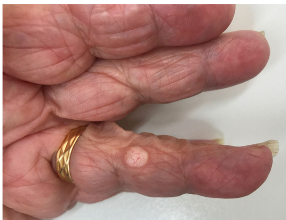
Fig. 1 Well-demarcated nodule measuring 7 × 5.7 mm with superficial vascularization.

An 89-year-old woman presented with an indurated whitish nodule with superficial vascularization on the fourth finger of her left hand (Fig. 1). The lesion had been present for several years. Dermoscopy (Fig. 2) showed peripheral arborizing vessels against a whitish background and an erythematous halo around the lesion. The lesion was excised and sent for pathologic examination (Fig. 3).