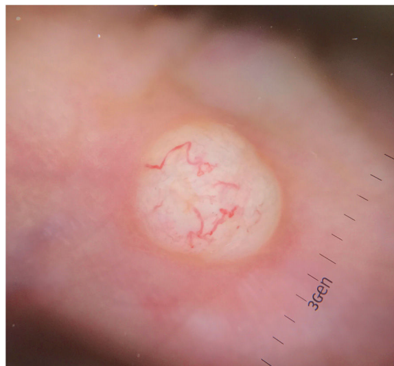
Fig. 2 Homogeneous white lesion with perilesional erythema and peripheral arborizing vessels.