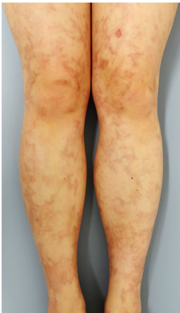
Figure 1 Infiltrative brownish erythema and livedo racemosa on the bilateral lower legs.

PSL: prednisolone, CPA; cyclophosphamide, MTX; methotrexate, AZA azathioprine, MMF; mycophenolate mofetil.