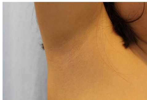
Figure 2 Less severe lesions in the right armpit.

FFD, also known as apocrine miliaria, was first described in 1902 by George Henry Fox and John Addison Fordyce. It is a rare chronic disease that typically appears in post-pubescent women (15–35 years of age). 1 Presentation in childhood is exceptional. 2 The etiology is unknown and the cause is probably multifactorial. 3 Its association with hormonal factors has been postulated, given the age range in