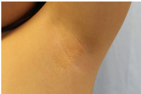
Figure 1 Millimeter-sized confluent perifollicular papules with a yellowish color and elastic consistency, in the left armpit.

Histology of a punch biopsy of one of the lesions revealed dilation of the follicular infundibulum and a perifollicular aggregation of foam cells (Fig. 3). These results were compatible with a diagnosis of Fox-Fordyce disease (FFD).