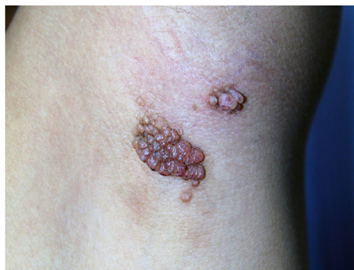
Figure 1 Erythematous grouped vesicles over left axilla.

Presence of lacunae is the most commonly described histological feature of LS which correspond to the dilated,