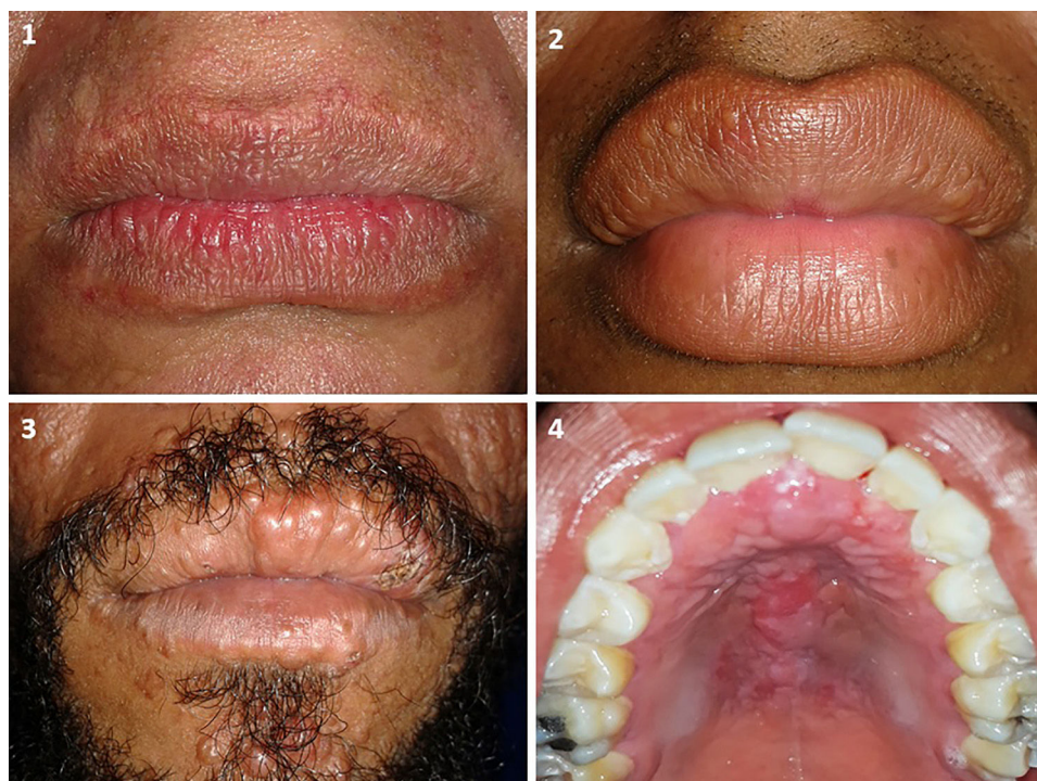
Figure 1 Leprosy-related lesions. A, Leprous plaque on the upper and lower lips. B, Lepromas on the upper lip. C, Lepromas on the upper and lower lips. D, Leproma on the palate.