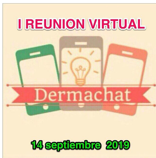
Figure 2 Logo of the Dermachat informal instant-messaging group, which includes almost 500 dermatologists, with the logo of the "1st Virtual Dermachat Congress", which has held on Saturday, September 14, 2019.

After this analysis, we ask ourselves, what opportunities are provided by being aware of these weaknesses and dealing with them using old methods and new technologies? What