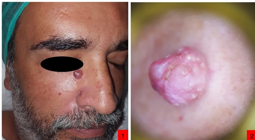
Figure 1 A, Red nodule with a smooth surface located in the upper third of the right nasogenian sulcus. B, Dermoscopy. Reddish-white bed with irregular telangiectatic vessels and cotton-white areas.

Chondroid syringoma is a benign tumor of adnexal origin that is more frequent in young men, and is typically located on the head and neck area, in particular on the nose, cheek, and upper lip, although involvement of other regions including the trunk, genital area, and extremities has also been described. 3 This tumor is usually solitary and rarely exceeds 2 cm in diameter. Malignant transformation is very rare but should be suspected in cases of chondroid syringoma