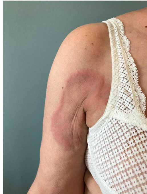
Figure 1 Erythematous, edematous, nonscaling plaque with neat borders and annular morphology on the anterior aspect of the right arm.

A skin biopsy revealed an unaltered epidermis, interstitial histiocytic infiltrate with perivascular accentuation along the entire thickness of the dermis, and an absence of mucin deposits. In certain fields, higher magnification revealed some interstitial and intravascular neutrophils (Fig. 3), based on which a histopathological diagnosis of IGD was established.