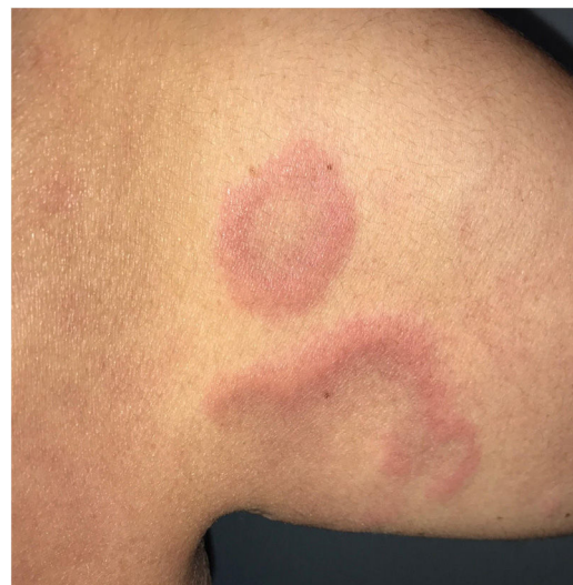
Figure 2 Two similar lesions with clear arciform morphology located on the posterior aspect of the right arm.