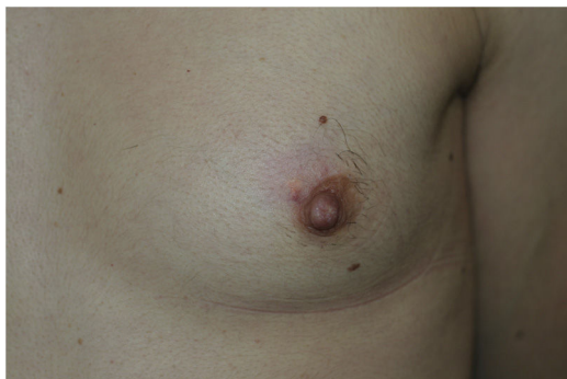
Figure 3 Clinical improvement 3 months after intralesional infiltration with triamcinolone.