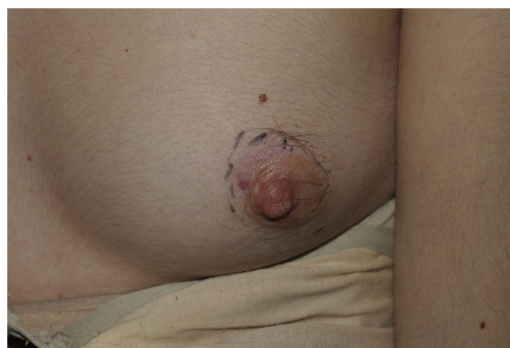
Figure 1 Indurated, erythematous, and elongated lesion affecting the left areola. The lesion was painful to touch.

For many years, mamillary fistula was thought to result from obstruction of a distal milk duct by squamous metaplasia, with keratinization and/or epidermalization of the duct. However, it was recently proposed that mamillary fistula originates in a hair follicle, where the initial event is occlusion of the follicle because of hyperkeratinization. This leads to dilatation and rupture of the duct, with release of secretions into the subcutaneous cell tissue and, therefore, an inflammatory reaction, secondary bacterial infection, and, finally, formation of abscesses with drainage of sinus tracts and fistulas in the area of the areola. 3 In this case, the squamous metaplasia identified in the biopsy specimens would represent the response of the tissue to a chronic inflammatory process, thus indicating that it is a result of