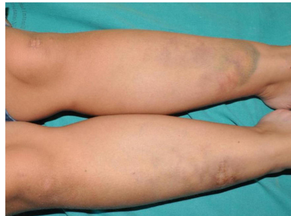
Figure 1 Extensive purpuric lesion on the anterior aspect of the middle and distal third of the left leg, and reticulated erythematous-violaceous lesions on the contralateral leg. Note the presence of 2 atrophic scars on the distal third of the right leg and on the left knee.

echogenic subcutaneous tissue. Doppler signal was absent. In the directed anamnesis the patient's mother reported that the girl had been born preterm due to premature rupture of membranes and had muscular hypotonia during the neonatal period. The patient was undergoing tests in the endocrinology department of another hospital for short stature and disproportion between the trunk and limbs. The family history provided by the mother included joint hyperlaxity, abnormal scarring, and early osteoarthritis. The patient also presented with skin hyperextensibility, joint hypermobility, and Gorlin sign (ability to reach the nose with the tip of the tongue) (Fig. 3). Based on these data a suspected diagnosis of classic EDS was established. A cardiological examination, including electrocardiogram and echocardiography, revealed no findings of interest, and the