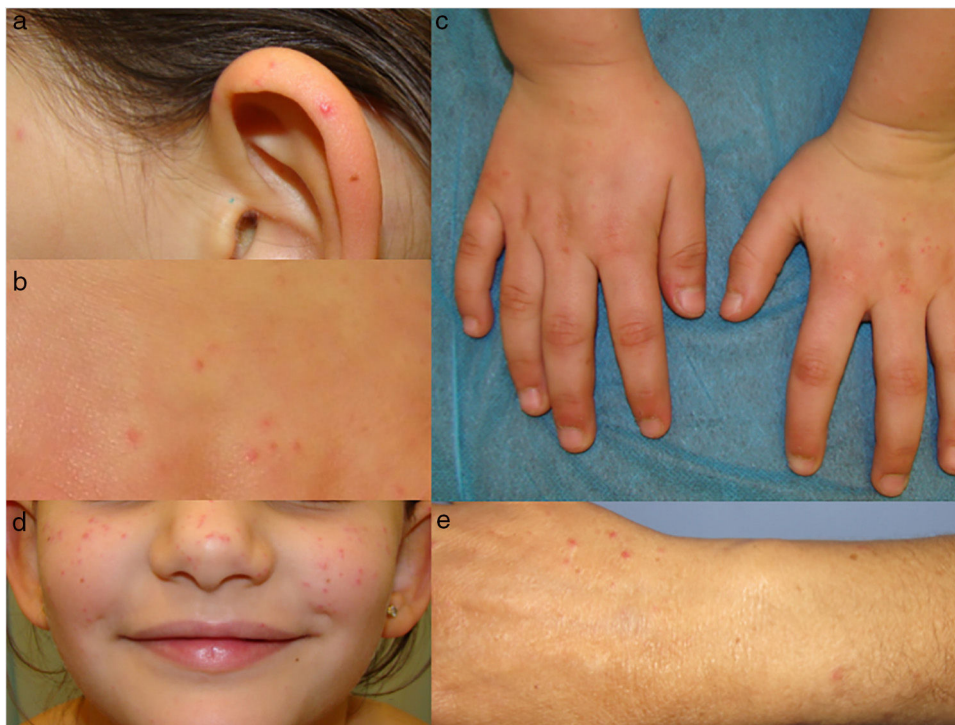
Figure 1 A–D, Erythematous-violaceous papular lesions with a peripheral whitish halo in a 7-year-old girl. E, Image of patient 2, showing erythematous lesions on the forearms.

on the cheeks and arms, whereas those of the grandmother were found mainly on the forearms. Histopathology of biopsy specimens from both patients was indicative of eruptive pseudoangiomatosis (Fig. 2).