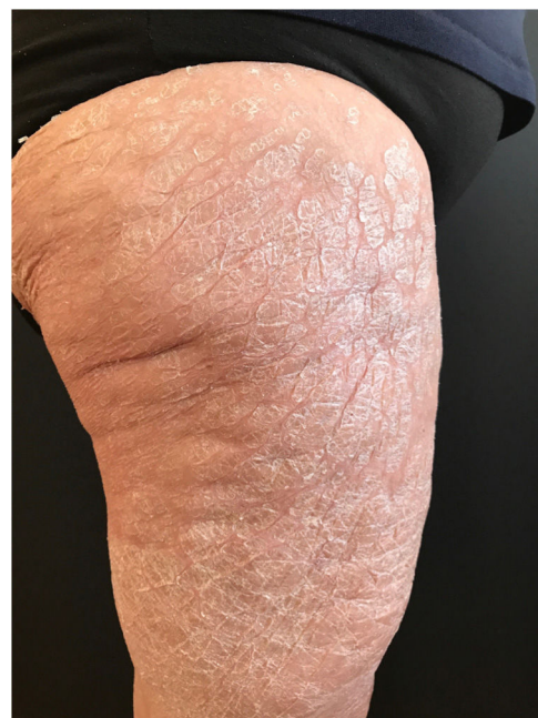
Figure 1 Scaly plaques especially notable on the anterior and lateral regions of both thighs.

Ponatinib is a third-generation tyrosine kinase inhibitor. It is part of the family of tyrosine kinase inhibitors such as imatinib, dasatinib, and nilotinib. 1 It is used as a