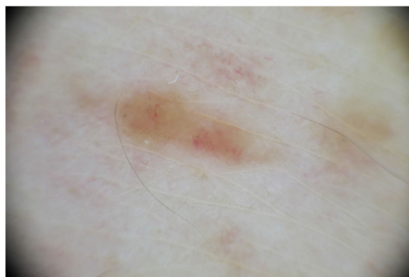
Figure 2 Dermoscopic image showing an area of homogeneous yellow-orange coloration within which linear vessels are evident. (A full-color version of this image can be found in the web version of this article.)

Sarcoidosis is a chronic systemic granulomatous disease of possible autoimmune etiology that primarily affects the lungs and lymph nodes. Induction of sarcoidosis, especially pulmonary and cutaneous forms, has been described in HCV patients treated with IFN alfa and ribavirin. It is thought that IFN alfa favors the differentiation of CD4 T cells, promoting a Th1-type immune response with subsequent granuloma formation. This mechanism may be intensified by ribavirin. 2