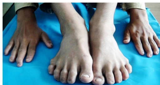
Figure 1 Total absence of nails of 5 th toes.

A 15-year-old boy, otherwise healthy presented with absence of nails of both hands' ring fingers and little fin- gers and both feet's 5 th toenails and hypoplastic nails of the 2 nd , 3 rd and 4 th toes, since birth (Figure 1). He was born of non-consanguineous marriage. His mother was suf- fering from epilepsy and was prescribed oral phenytoin 100 mg three times daily since her 20 years of age. Pheny- toin was continued throughout her pregnancy and drug levels were not monitored. Along with phenytoin, folic acid 5 mg once daily was prescribed to the patient. Patient's past and family history was insignificant and his sibling didn't suffer from any anomalies. He was of normal intel- ligence. On examination there was also flexion deformities of the distal interphalangeal joints and slight extension of his proximal interphalangeal joints of the left middle and ring finger and right middle finger (Figures 2 and 3).