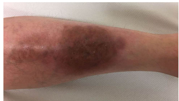
Figure 2 Residual lesion on the left leg after treatment with ustekinumab and cyclosporin for 12 weeks.

weeks thereafter) associated with cyclosporin at a dose of 3 mg/kg/d, with an excellent response of the pyoderma gangrenosum, which resolved completely in 12 weeks, making it possible to reduce the dosage of prednisone to 5 mg/d (Fig. 2). After 10 months of follow-up, the patient has maintained treatment with ustekinumab every 8 weeks with very good results; this has made it possible to withdraw the cyclosporin and reduce the prednisone to 2.5 mg every 2 days.