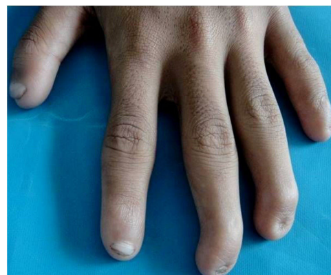
Figure 3 Anonychia of the ring and little finger of the left hand with flexion deformity of the middle and ring finger.