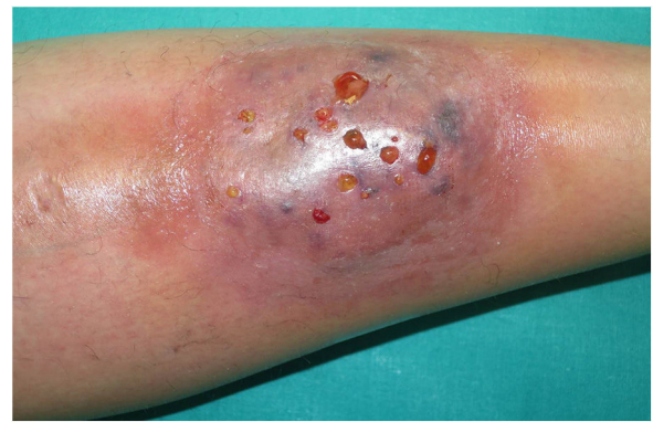
Figure 1 Skin lesion compatible with pyoderma gangrenosum on the lower part of the left leg. Image prior to combined treatment with ustekinumab and cyclosporin.