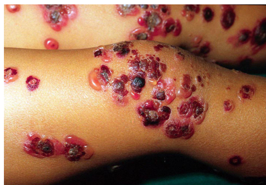
Figure 1 Skin lesions in a child with linear IgA bullous dermatosis. Note the numerous tense blisters arranged in a rosette-like pattern with a central crust.

The characteristic cutaneous manifestations of LABD are tense vesicles and blisters on a normal or erythematous base. The lesions form a rosette-like pattern with a crust in the center; new blisters can form around the edge, leading to what is known as the string of pearls sign (Fig. 1). Lesions are mainly located on the trunk, the lower abdomen, the axillae, the thighs, and around the mouth. 10 Lesions on the palms and soles are less common. In adults, lesions are