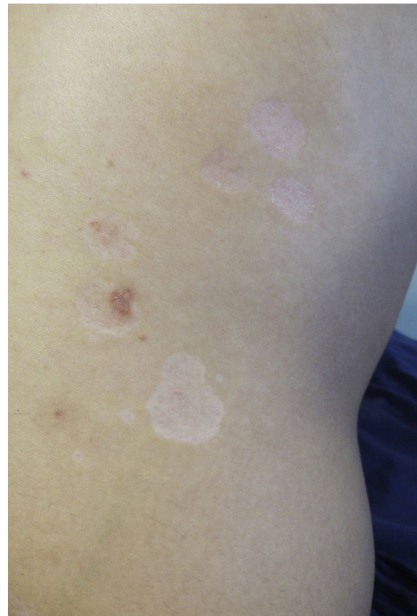
Figure 1 Slightly depressed hypopigmented and pink plaques of various sizes on the patient's back. Mild desquamation can be observed on some.

The patient was prescribed itraconazole 200 mg/d for 7 days combined with topical flutrimazole at night for 1 month. The topical corticosteroid was replaced by