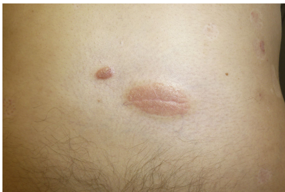
Figure 2 Psoriatic plaques in the center of depressed areas.

calcitriol ointment for treatment of his psoriasis. Although improvement was slow, the patient had fully recovered at 6 months, with no new lesions after 1 year of follow-up.