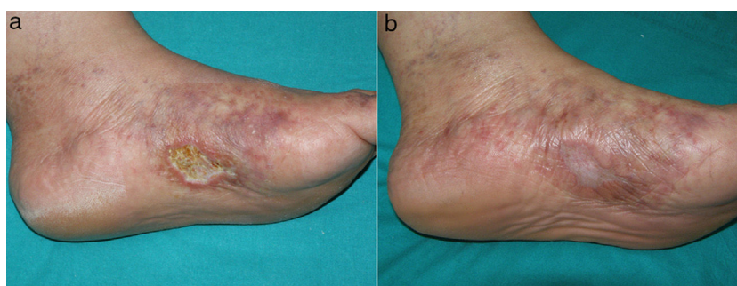
Figure 1 A, Cutaneous ulcer on the medial aspect of the left foot against a background of livedo racemosa and retiform purpura. B, Atrophic blanche due to scarring following the use of oral rivaroxaban.

A 53-year-old woman with no relevant past history presented with multiple skin ulcers on her feet. The ulcers were painful and had been present for 2 years. Physical examination revealed an ulcer measuring approximately 3 cm on the medial aspect of the left foot against a background of livedo racemosa and retiform purpura (Fig. 1A). The patient's