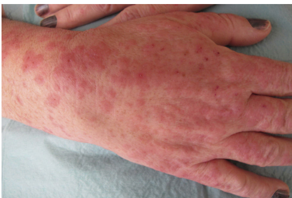
Figure 1 Erythematous-edematous lesions on the hand. Note how some of the lesions have a target appearance.

Physical examination revealed erythematous-edematous papules and plaques on the dorsum of the hands, forearms, arms, and ankles (Fig. 1) and a local inflammatory reaction in the area of the nasal dorsum where she had been applying the imiquimod cream (Fig. 2). Some of the plaques had the appearance of a target lesion but no mucosal involvement was observed.