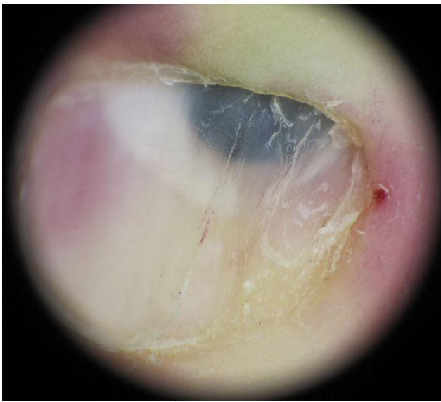
Figure 2 Circumscribed area of homogeneous bluish color.