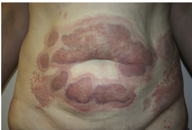
Figure 1 Geographic erythematous-purpuric plaques at the sites of injection of mesotherapy on the abdomen, hips, and thighs.

A 45-year-old woman with no past medical history of interest and not on any long-term medication, was seen in the emergency department for the appearance some days earlier of multiple, painful and pruritic, edematous erythematous plaques with purpuric geographic borders. In some areas the lesions were confluent, producing very large plaques (Fig. 1). Some of the lesions had developed superficial vesicles (Fig. 2) despite oral treatment with hydroxyzine, deflazacort, and cefalexin.