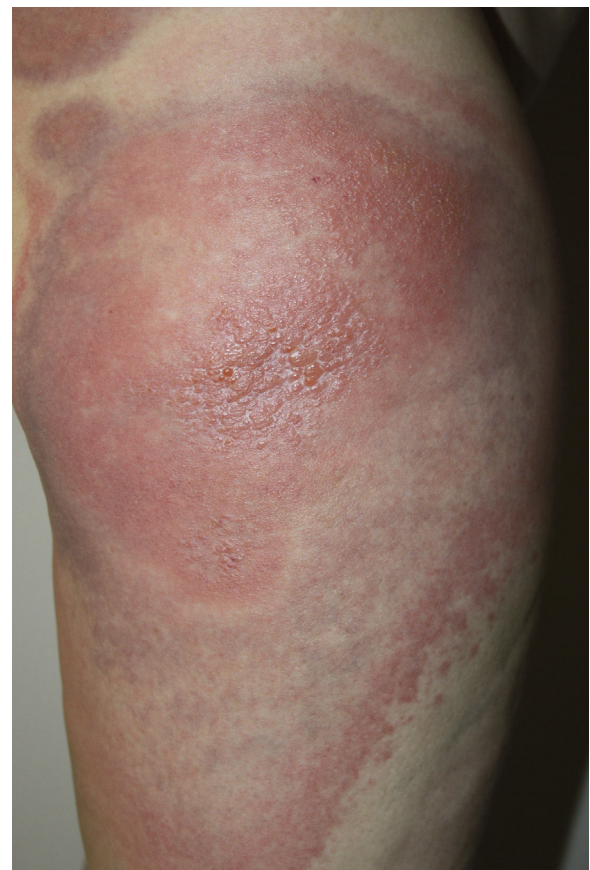
Figure 2 Confluent, erythematous edematous plaques with vesicles at the sites of injection of mesotherapy on the thigh.

After evaluation of the patient in the emergency department, treatment was started with oral prednisone, 1 mg/kg/d, plus amoxicillin-clavulanic acid, bilastine, and