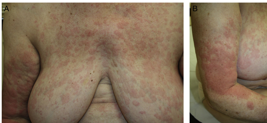
Figure 1 A and B, Urticarial rash of fleeting pink edematous papules and plaques on the trunk and limbs, with no desquamation.

Sequential treatment was started with colchicine, 100 mg/d, oral prednisone, 0.5 mg/kg/d, dapsone, 50 mg/d, and methotrexate, 15 mg/wk, with no improvement. In 2010, the patient commenced treatment with subcutaneous anakinra, 100 mg/d, leading to complete resolution of all her symptoms, including the nonspecific bone pain, within a week of starting treatment. The acute phase reactants normalized and no complications have arisen. At the time of writing, the monoclonal IgM- \kappa band persisted at levels between 2.40 and 2.85. Attempts to withdraw anakinra have led to immediate recurrence of the patient's symptoms, and she is currently asymptomatic on subcutaneous anakinra at a dose of 100 mg every 48 hours.