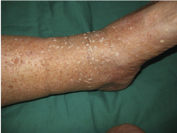
Figure 1 Hyperkeratotic lesion on the legs.

We report a 71-year-old male with multimorbidity (hypertension, diabetes mellitus, ischemic heart disease, mitral regurgitation, left bundle branch block, hepatic steatosis, fibrosing alveolitis, COPD, hypercholesterolemia, hyperuricemia and glaucoma) who presented hyperkeratotic lesions on the legs (Fig. 1). The patient had worked ten years