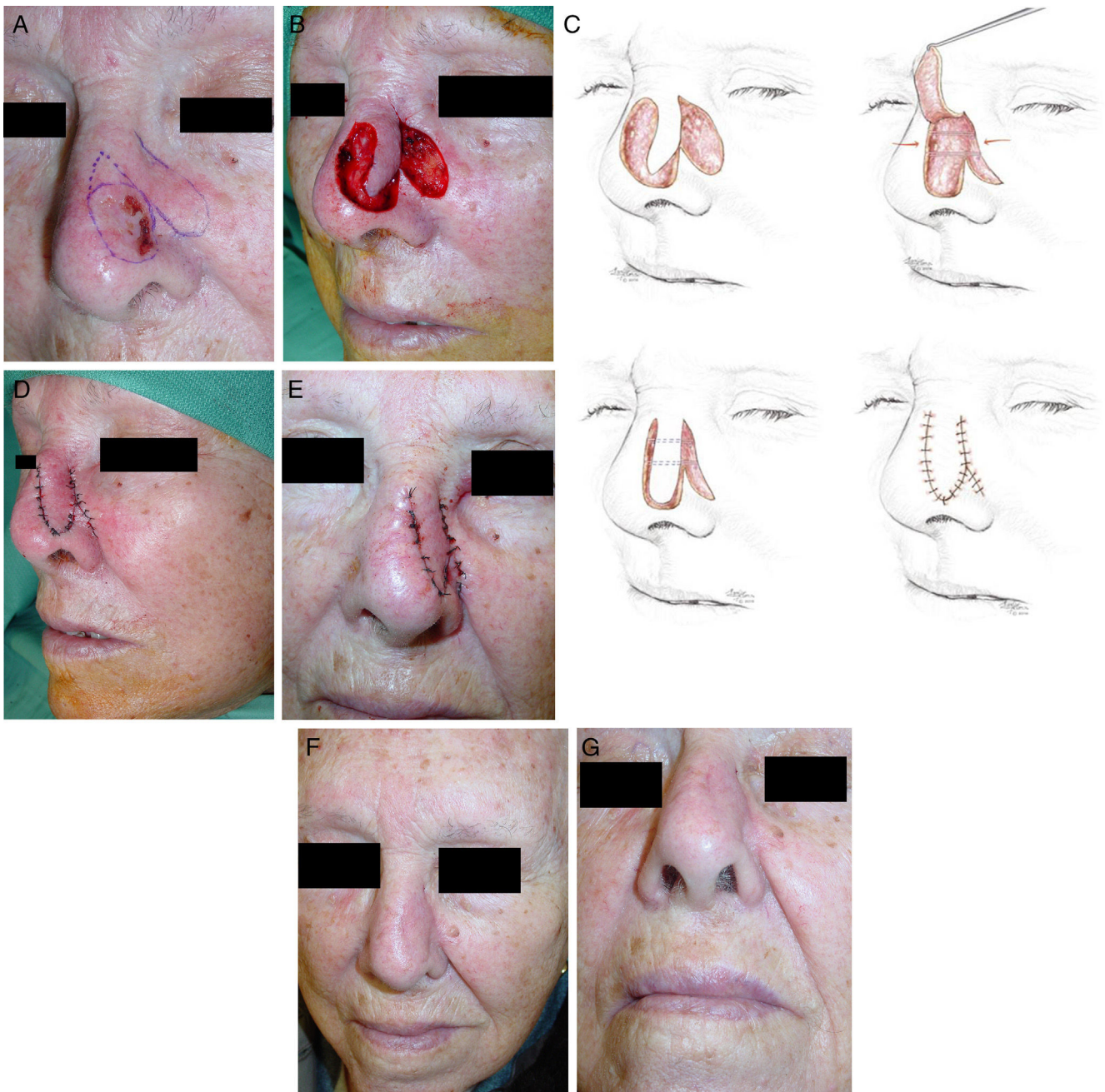
Figure 1 A, Basal cell carcinoma on the lateral wall of the nose. Design of the excision and of the reconstruction using a lobar transposition flap from the adjacent skin. B, Flap dissected in the subcutaneous plane, transposed to cover the defect. There is a noticeable difference between the size of the flap and the surface area of the wound. C, Series of drawings to illustrate the use of 2 guitar-string sutures to reduce the size of the defect and allow tension-free fixation of the flap. D, Result immediately after suturing with 6/0 silk. E, Appearance at 24 hours. F and G, Final outcome 2 months after surgery.

proportions are seen not to coincide, the lobar flap can be stretched by putting radial traction on its borders to adapt it to the surgical defect. This can lead to peripheral necrosis of the mobilized tissue, which will increase the risk of local infection and may require further operations to be performed to refresh the borders, or even the creation of new flaps or grafts.