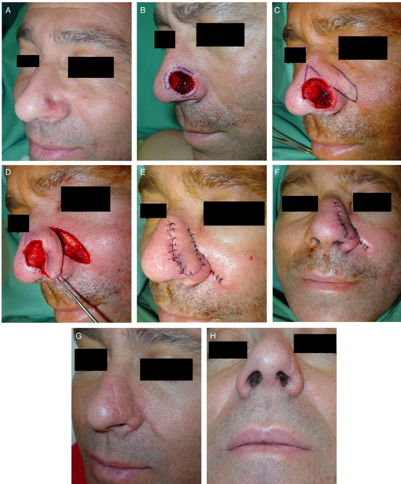
Figure 3 A, Male patient with carcinoma on the lateral wall of the nose that had recurred after previous surgery and radiotherapy, referred to perform 3-dimensional histologic study. B, Initial defect, with marking of the affected margins after histologic study of all the excision margins. C, Design of a lobar transposition flap on the skin superior to the defect, extending towards the nasolabial sulcus. D, Definitive defect after the final stage at the inferior part of the defect, close to the free border of the ala, and flap dissected along a deep plane. Transposition and rotation movement of the flap with the aid of a hook. E and F, Final outcome after transposition of the flap and suturing of the skin with 6/0 silk. Previously, the area of the wound had been reduced using a guitar-string suture. G and H, Final outcome 6 months after surgery.