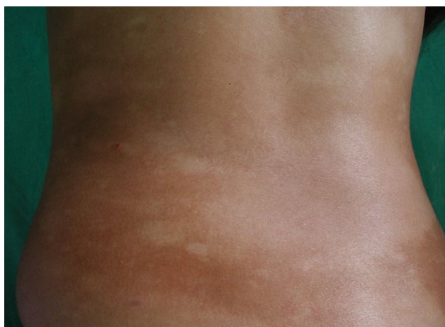
Figure 2 Patient #5. Hypopigmented macules.

reflected in our study by the time it took to establish a diagnosis (3 years and 6 months) and the low level of clinical suspicion at the first visit, where just 57% of children were diagnosed with MF.