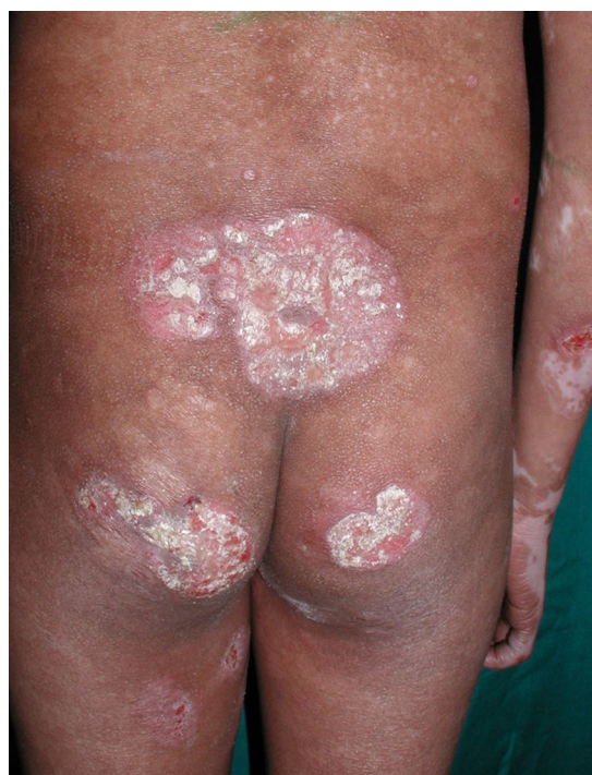
Figure 4 Patient #1. Achromic macules, plaques, and ulcerated tumor.

after several years. These situations have been described infrequently in the literature.