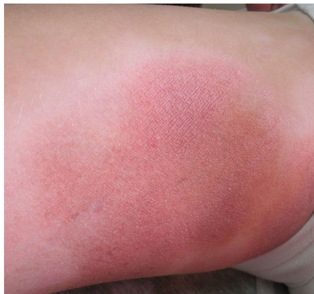
Figure 3 Patient #4. Classic macules.

Hypopigmented MF is the most common clinical variant of MF in children, and is particularly frequent in patients with Fitzpatrick skin types III or IV. 4,5,7,8,10,11,13,16,17 Forty percent of our patients had hypopigmented lesions coexisting with classic MF lesions, supporting previous reports. 6,8,10 It should be highlighted that 1 patient in our series had a clinical diagnosis of pityriasis lichenoides chronica but histopathologic findings consistent with MF. Another 2 patients, one with a diagnosis of pityriasis lichenoides chronica and the other with a diagnosis of lymphomatoid papulosis developed MF