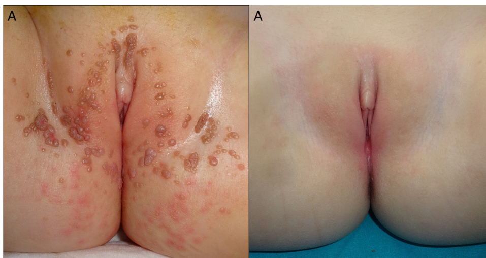
Figure 1 (A) Multiple vestibular and vulvar condyloma acuminata. (B) 13-month follow-up post-CO 2 laser surgery of anogenital condyloma acuminata.

Anogenital CA in the pediatric population is not rare in daily practice as one may suppose. 1,2 However, giant periurethral condyloma occurs exceptionally