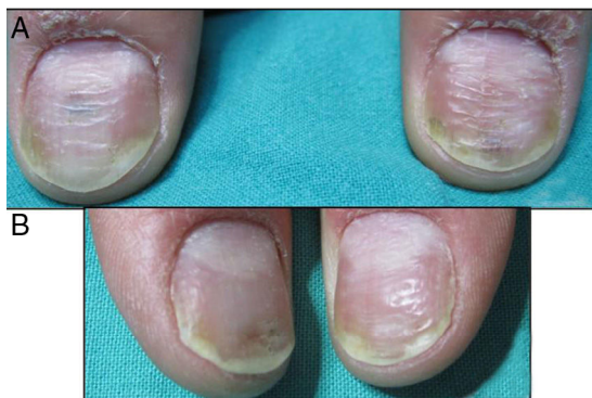
Figure 2 (A) Matrix and bed nail psoriasis before treatment. (B) After four sessions of PDL (right thumbnail) and four sessions of Nd:YAG (left thumbnail).

All patients experience improvement in the global, matrix and nail bed NAPSI score (Figs. 1–4). The pre-treatment global NAPSI mean was 34.85 \pm 13.898 and the post-treatment was 19.38 \pm 12.48 with a diminution of the