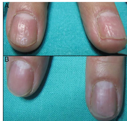
Figure 4 (A) Nail matrix psoriasis of the right hand before treatment. (B) After four sessions of PDL.

global mean of 15.46 ( p < 0.000 ) (Table 1). Unlike other studies, we did not find a significant difference between the drop in the matrix and the nail bed NAPSI score mean.