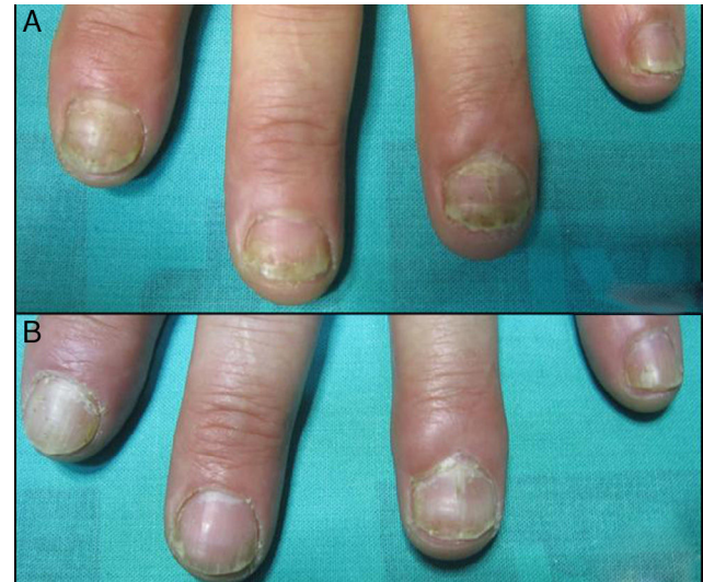
Figure 3 (A) Distal onycholysis, subungueal hyperkeratosis and distal oil drop of nail plate psoriasis of the left hand before the treatment. (B) After four sessions of Nd:YAG.