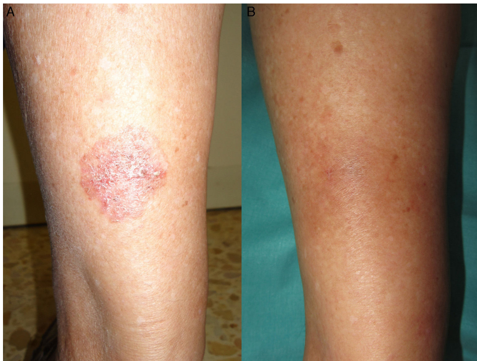
Figure 3 A, Bowen disease lesion that would have been difficult to treat surgically on the posterior surface of the left leg in an 80-year-old woman. B, Complete clearance of the lesion after 3 cycles of photodynamic therapy with methyl aminolevulinate. No evidence of sequelae or recurrence was detected during follow-up.