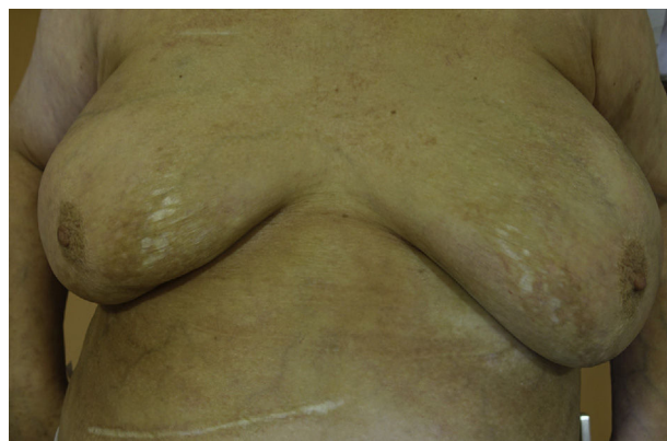
Figure 1 Patches in both breasts and left inframammary fold, showing a shiny white color, lilaceous ring and atrophic surface.

In different clinical trials, anti-PD1 therapies such as Pembrolizumab or Nivolumab showed a relatively safe profile, with a low incidence of major adverse effects (drug-related grade 3 or 4 toxic effects only in 14% of the patients), being those related with pneumonitis the most severe of them. 10 These adverse reactions related with immune-checkpoints inhibitors have been named as immune-related adverse events (irAEs). When focusing on the skin irAEs, non-specific macular papular rash and pruritus have