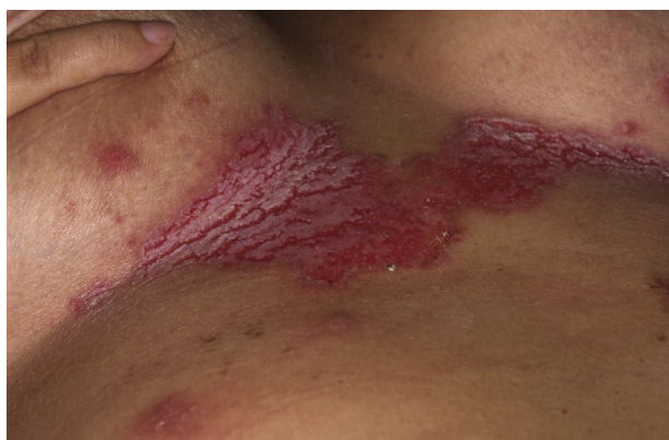
Figure 1 Erosive plaque in the submammary region, compatible with benign familial pemphigus.

Papular acantholytic dyskeratosis (PAD) of the vulva, first described in 1984 by Chorzeliski et al., 1 mainly affects young women, typically on the labia majora, although it has also been described on the penis in men, in the anal canal, and in the inguinal folds. 2,3 It usually presents as multiple whitish papules that may coalesce to form plaques; solitary papules are rare. Most commonly it is asymptomatic, although intense pruritus can occur. Histopathology reveals acantholysis with varying degrees of dyskeratosis, and direct and indirect immunofluorescence are negative in almost all cases studied. 4 Though initially considered an independent entity, its relationship with Darier disease (DD) and with BFP has been under discussion due to the histologic similarity between the diseases. 5 The etiology of PAD is unclear. The majority of cases are sporadic, but there have been reports in recent years of cases of DAP due to mutations in genes ATP2A2 6 and ATP2C1 , 7-9 which are mutations