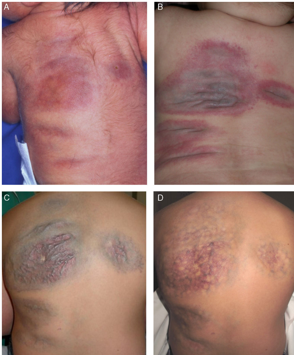
Figure 1 Clinical course of the lesions. A, Newborn: erythematous-violaceous plaques on the back. B, At 6 months of age: plaques with prominent vessels, erythematous borders, and a blue-violaceous center. C, Before laser treatment (7 years of age). D, After 10 sessions of combined pulsed dye and neodymium-doped yttrium aluminium garnet laser treatment (11 years of age).